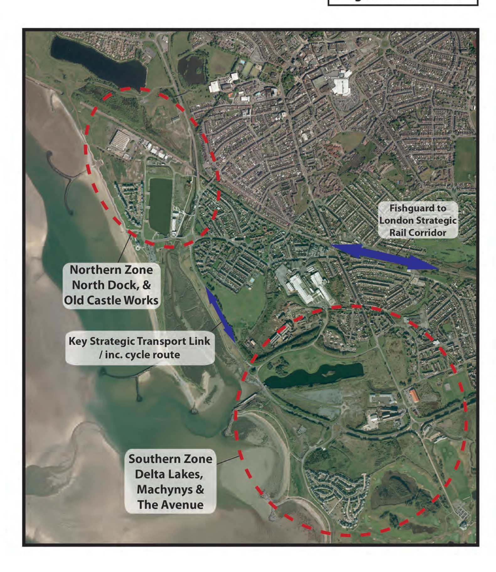
Figure 2: Aerial Plan